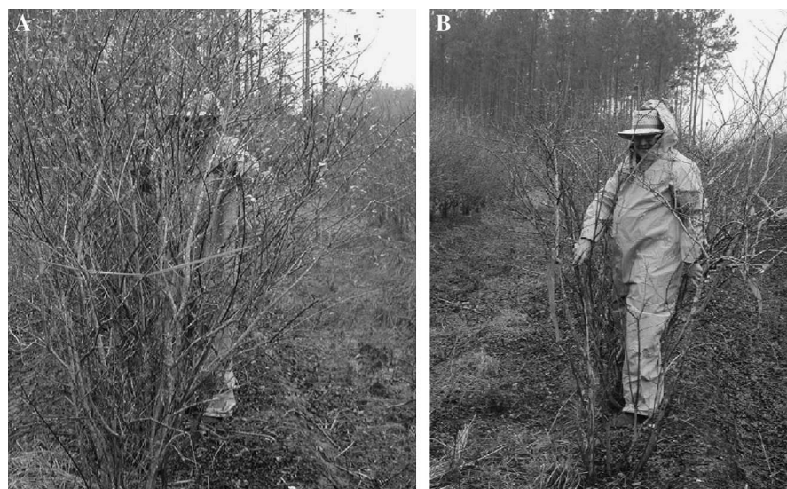
Fig. 2. Six-year-old 'Brightwell' rabbiteye blueberry plants used for mechanical harvesting with the V45 harvester. (A) A 'Brightwell' blueberry plant photographed before being pruned. Note the many upright canes in the middle of the plant. (B) A 'Brightwell' plant after it was pruned to cut out upright canes in the middle. Sufficient numbers of canes were pruned to create an opening wide enough for the pruner to walk through.

In 'Brightwell' rabbiteye blueberry plants that had about six large canes, the removal of several canes to allow operation of the V45 harvester reduced yield (Table 1). Although vigorous regrowth occurred, fruit produced on 1-year-old renewal canes was not sufficient to compensate for yield loss resulting from several large mature canes being cut out. Even 16 months later, pruned 'Brightwell' plants yielded only about 60% of unpruned plants (Table 1). Plants of 'Brightwell' blueberry are more vigorous than 'Powderblue' plants and are branch forming and irregular in shape, and thus develop more canes and lateral branches that overarch in the middle. Overarching