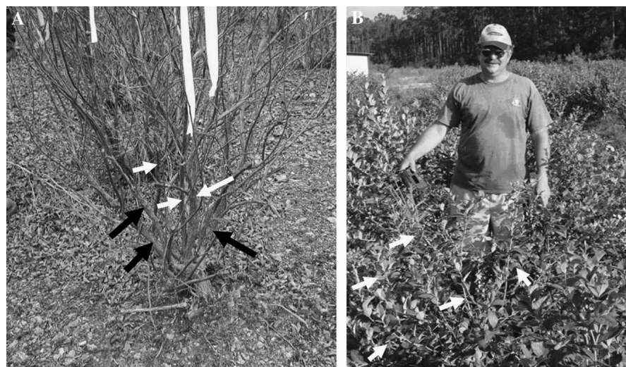
Fig. 3. Four-year-old 'FL 86-19' southern highbush blueberry plant. (A) Note there are about six mature primary scaffold branches (black and white arrows) on the trunk (photographed Feb. 2005). Pruning for V45 mechanical harvesting involved the cutting of upright scaffold branches (white arrows) in June 2004 and Feb. 2005. (B) An 'FL 86-19' southern highbush blueberry plant pruned in June 2004 for V45 machine harvesting in Spring 2005 (photograph taken 24 Apr. 2005). Note the absence of mature canes in the center of the plant and the amount of current-year cane growth (arrows).

fruit-to-machine parts, and fruit-to-plant structure contacts. Also, with the sway harvester the detached fruit can be flung horizontally to side wall panel at rather high velocity and fall as much as 5 ft. All these events can disturb the bloom, cause internal damage, or split the skin (Table 2). Fruit detached by the V45 harvester fall generally straight down 12 inches onto a padded, inclined catching surface ("NoBruze" cushioning; Connecticut Valley Corp., Shelton, CT). Brown et al. (1996) showed that 'Bluecrop'